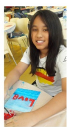
• Canvas painting •

God's existence, revealing His truths and generate spiritual curiosity socially. Our children even participated in writing and drawing their own life story boards of how they got to know Christ. They got to learn that praying for their friends is a way to