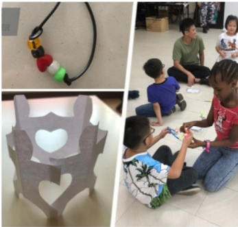
3 Evangelism Tools

God's existence, revealing His truths and generate spiritual curiosity socially. Our children even participated in writing and drawing their own life story boards of how they got to know Christ. They got to learn that praying for their friends is a way to